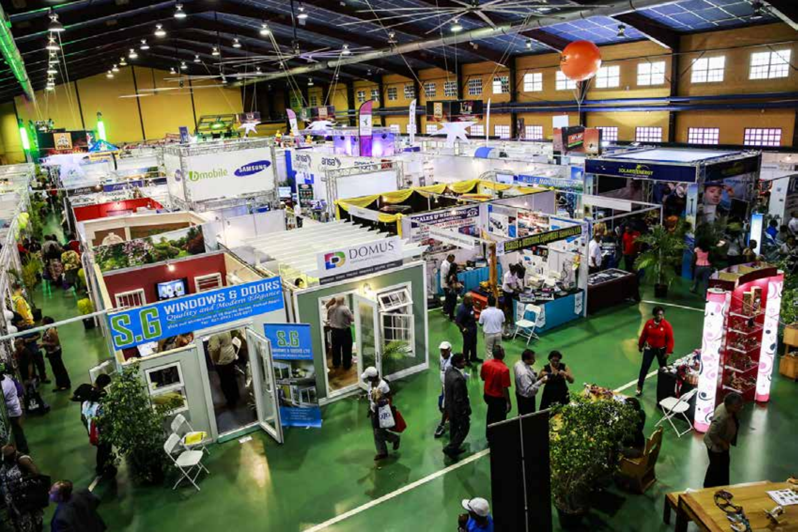
A BIRD'S EYE VIEW OF THE TRADESHOW FLOOR